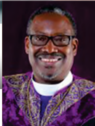
Sixteenth Episcopal District Co-Chair, AMEC Department of Retirement Services