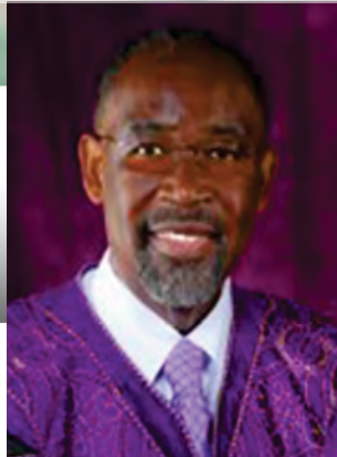
Ninth Episcopal District Chair, AMEC Commission on Economic Development