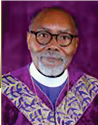
Fourth Episcopal District Chair, AMEC Department of Retirement Services